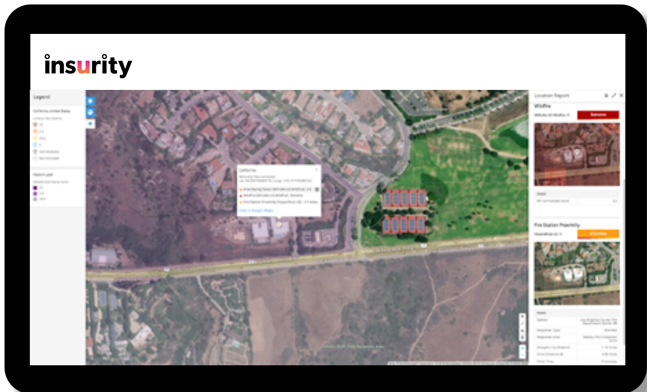
The above underwriting report, as shown within Insurity's SpatialKey Underwriting solution, includes critical fire station data from HazardHub along with the relative risk score of the peril itself from Willis Re. This combination of data points helps to contextualize and price risk in a single view.

A volatile risk like wildfire, for example, necessitates multiple expert data points to effectively select and price the risk. It's clear that a single score is no longer sufficient. Instead, insurers may need a risk score from one provider that accounts for fire, smoke, and wind-driven embers, along with risk mitigation data from another provider that includes distance to fire station and fire hydrants. Next, it's important to understand current portfolio accumulations in proximity to the perspective risk. Furthermore, there may be other potential risks from other data sources that aid in developing a more holistic view of risk.